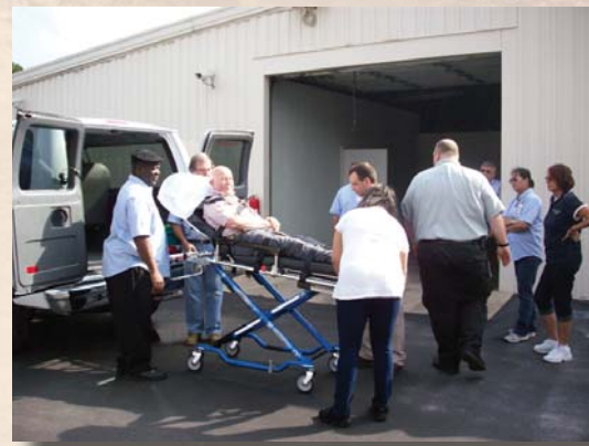
Training attendees participate in a hands-on demonstration.