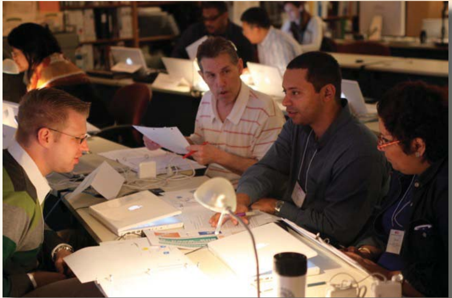
Training participants working on an interactive group activity while attending the NTI "Integrating Transit Applications (TCIP)" class.

Numerous Florida public transportation professionals attended the TCIP course. Attendees also included some international students. This training offered participants a