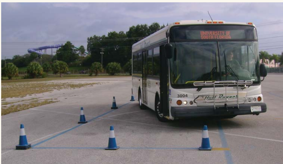
Left: Practicing parallel parking.