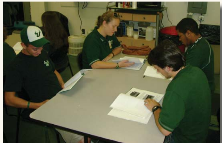
Above: New student drivers studying the pre-trip inspection.