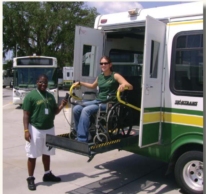
Above: Student drivers participating in a Disability Awareness class.