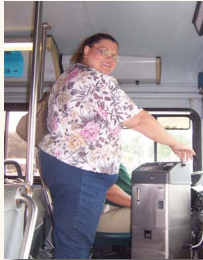
One PCPT passenger shared her comments with staff telling them how convenient the new fare boxes are. “It makes boarding so much faster,” she said.

Previously, riders were required to pay with exact change for one-way fares and daily passes, or show the driver the monthly pass purchased at the Pasco County libraries. This new technology scans all currency as it is inserted in the