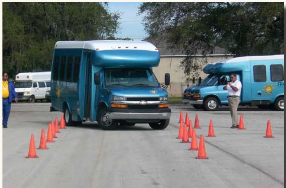
Vehicle Control Driving Course