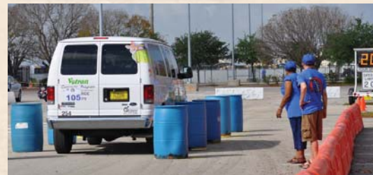
Above: Diminishing Clearance