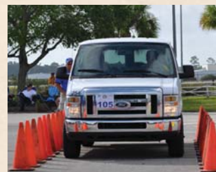
Operators compete in Roadeo events.