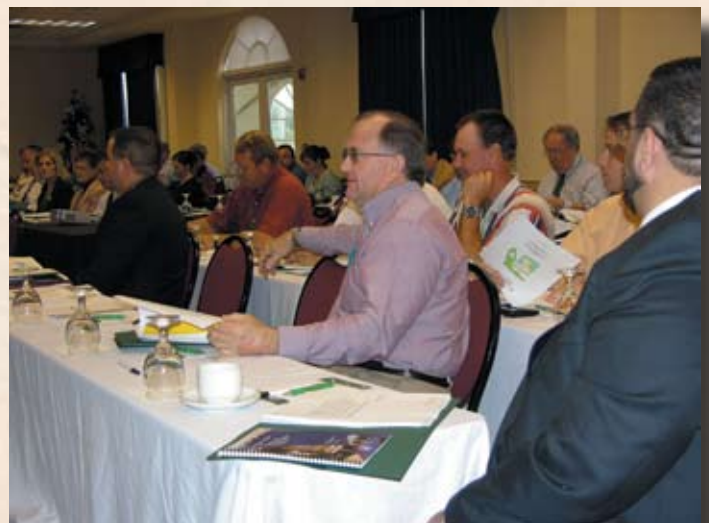
Summit participants engaged in a presentation of the Rural Transit Planning and Marketing Assessment study