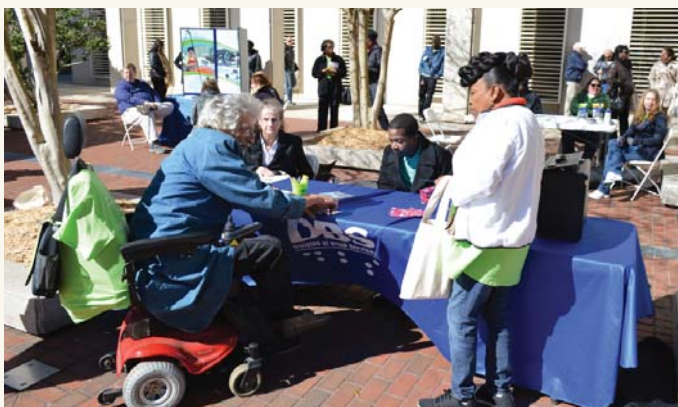
The Division of Blind Services staffed one of several information booths at the Annual Transportation Disadvantaged Legislative Awareness Day.