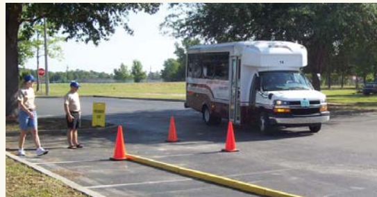
2012 Roadeo Passenger Stop

It's that time again – roundup your best drivers and come participate in the 17 th Annual Florida RTAP Paratransit Roadeo. There will be training opportunities for the participants. Then the participant's skills will be tested with a written test and the on-course competition. As always, the event will end with an Awards Banquet that will crown and recognize our champions in both the van and cutaway division.