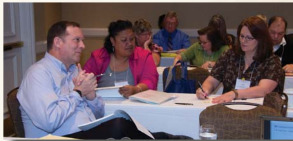
Workshop participants in a training session work together on a group activity.

The goal of the Workshop was to offer professional development and educational enrichment opportunities to public transit professionals. The one-stop workshop offered public transit professionals an excellent opportunity to learn from industry experts, attend professional development training, learn about research updates, and network with their peers. Workshop attendees participated in educational training classes and general session discussions that stimulated new ideas and identified creative solutions to problem solving and strategic planning.