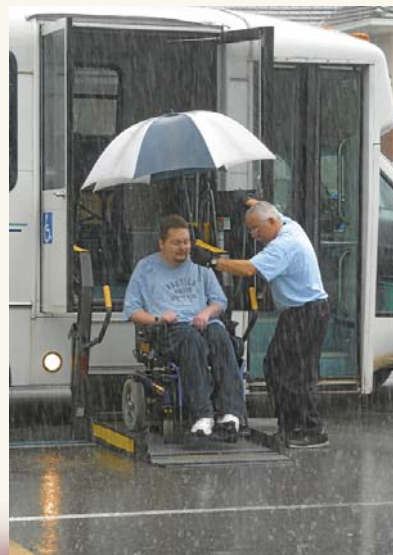
“Rain or Shine”