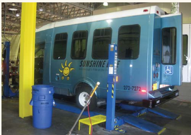
Sunshine Line Maintenance Facility