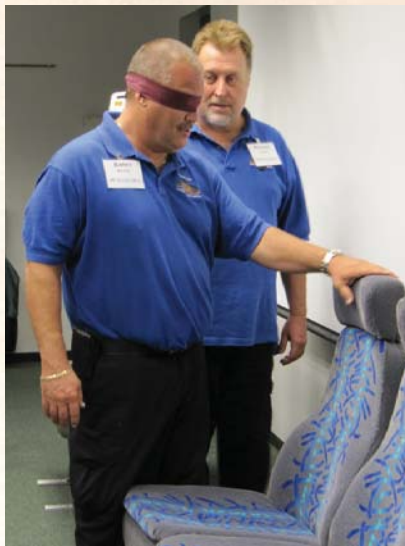
Attendees learn to correctly guide a passenger with a visual disability to a bus seat.