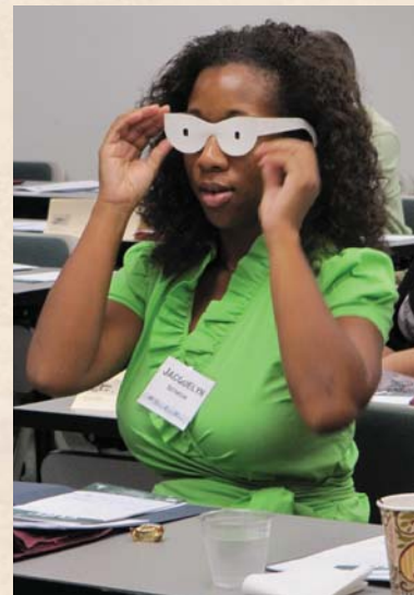
Attendees try on glasses which simulate various types of vision loss.