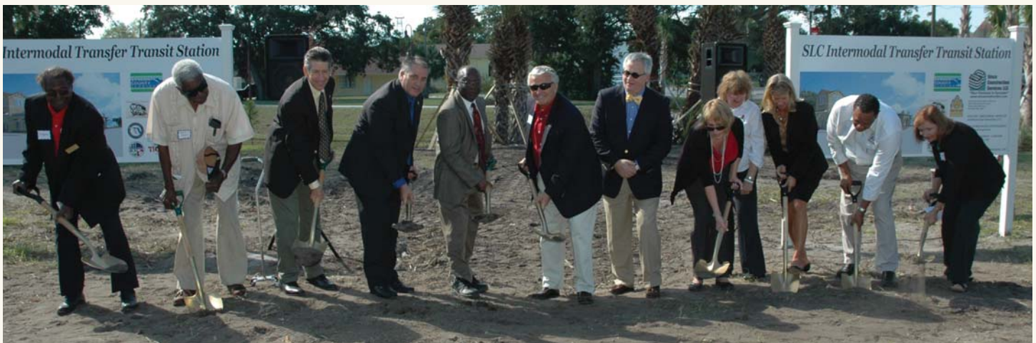
Representatives from the Florida House and Senate, Department of Transportation, as well as past and present members of the City of Fort Pierce Commission and St. Lucie County Board of County Commissioners, the Fort Pierce Redevelopment Agency, St. Lucie County School Board and the Council on Aging participated the groundbreaking.

Sisca Construction Services, the general contractor selected for this project, began construction in mid-October 2010. The transit facility is expected to be completed by mid-June 2011.