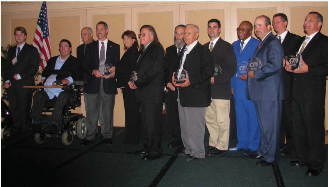
2009 TD Conference Award Recipients