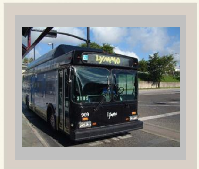
FLORIDA'S PUBLIC TRANSPORTATION TRAINING